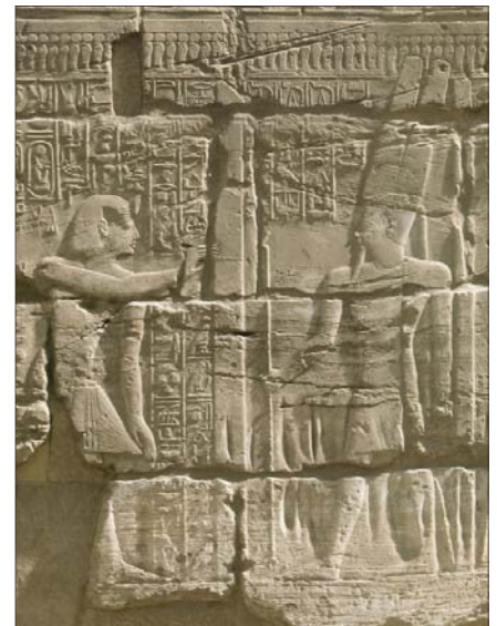
Seti I draws back the door bolt on Amun-Ra's shrine (Episode C).

The first group of rituals took place once the priest had reached the sanctuary, but before he had opened the shrine. The remaining episodes began after the shrine doors had been opened, and continued through the closing of the shrine and the exit of the priest. Following these rites, the priest redistributed the food and drink offered to the statue of the god among the temple personnel. This act was also imbued with cultic significance, and it constituted a separate group of scenes, known as the “reversion of offerings.”