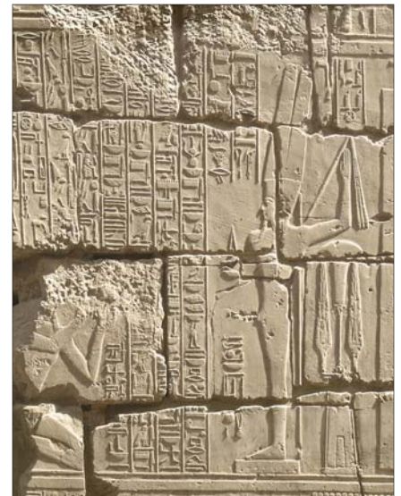
Episode 17: The king offers the nemset jar to Amun-Ra.

The priest now begins to read the traditional list of offerings that the god would have expected as sustenance each day. This list, called the “menu of every day,” composes episode twenty. Following this, the priest then recites an additional list of offerings for the god, entitled “a boon which the king gives.” He subsequently lays out the mentioned offerings on the table for the god’s meal. These actions comprise episodes twenty-one and twenty-two. To prepare the god for his repast, in episodes twenty-three and twenty-four the priest pours a libation