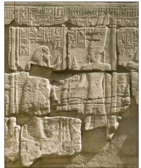
Episode B: Sety I breaks the seal of the Amun-Ra shrine.

The performance of the Daily Ritual began in the early morning, with the entrance of the purified priest into the sanctuary. He lit a torch and burned incense, illuminating and cleansing the darkened, most sacred space of the temple. Next, he approached the shrine holding the cult statue of the god Amun. The seal securing the doors was broken, the bolts pulled back, and the door to the shrine opened, revealing the image of the god. The priest then knelt before the god, kissing the ground before Amun. After raising himself, he chanted greetings and praises to the god, while censuring and offering precious spices and oils to the statue. He removed the figure from the shrine, cleaning and purifying the image before ornamenting it in fresh linen, oils and cosmetics. After being purified a second time, the god's statue was returned to the shrine. The priest then invited the god to inhabit his statue, and offered him food and drink for sustenance. Af-