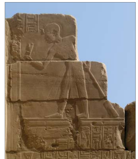
Episode 30: The king “drives out demons” during the closing ritual.

The next episode, thirty-five, starts the actual process of reversion. Sety is not shown actually removing items from the table of the god, but instead kneeling and pouring another libation, this time into a stand topped by a bouquet of papyrus. The comparable episode from Medinet Habu shows the king still grasping